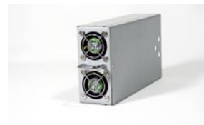
Clavister Security Gateway 5500 Series - Cooling FAN Module