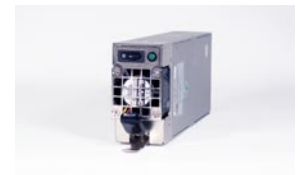
Clavister Security Gateway 5500 Series - Power Supply Module