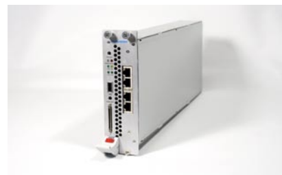
Clavister Security Gateway 5500 Series - Secure Blade Module