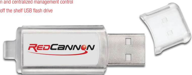
Fig. 3: KeyPoint Vault delivers drag-and-drop encryption and centralized management control to any off the shelf USB flash drive